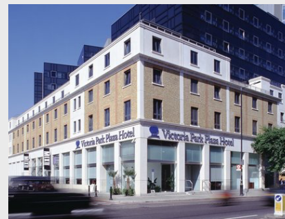
Park Plaza Victoria 239 Vauxhall Bridge Rd, Pimlico, London SW1V 1EQ, UK

Discount available for sponsorships at multiple IBM IoT Exchange events