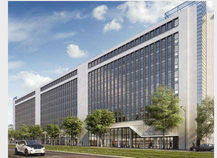
Châteaufort' City Le Metropolitan 13ter Boulevard Berthier, 75017 Paris, France

Discount available for sponsorships at multiple IBM IoT Exchange events