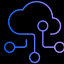
Watson IoT Platform